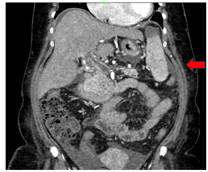
Figure 2. portal venous phase- CECT abdomen, coronal reformatted image showing portal venous obstruction